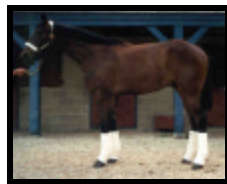
IRISH COLONY BEFORE AND AFTER